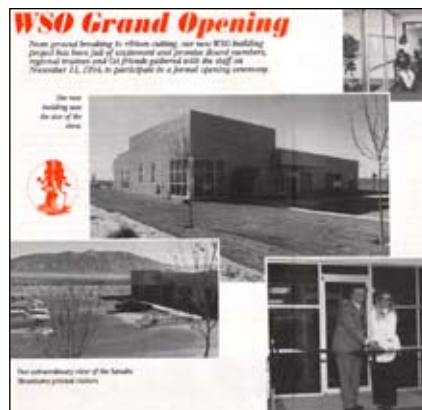
Nov. 11, 1994, reprinted from Lifeline , January 1995

The 1980s Conference delegates clarified the definition of “anonymity,” voted a non-OA member to the Board of Trustees, formed Region Nine (all areas outside the United States),